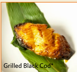
Grilled Black Cod*

Orders above £12 delivered free of charge to: N4, N6, N8, N10, N19, N22.