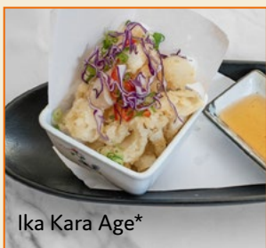
Ika Kara Age*